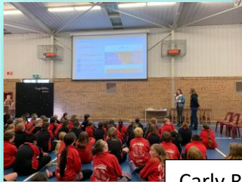
Carly Ryan Foundatio