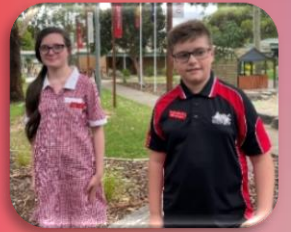
Year 6 Leadership