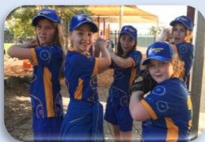
Onkaparinga North SAPSASA Softball Girls