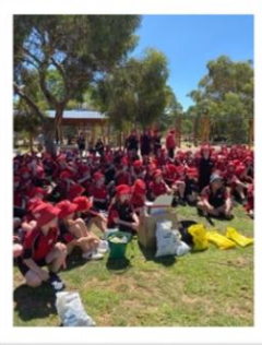
Year 6 Dream and Lead Conference