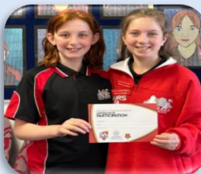
Onkaparinga North SAPSASA Swimming trials