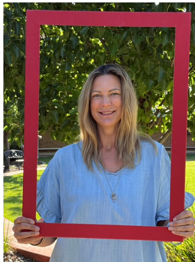
Nikki Bridgman Performing Arts