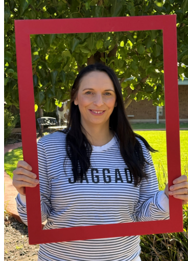
Dani Welfare Rm 6 Reception/1