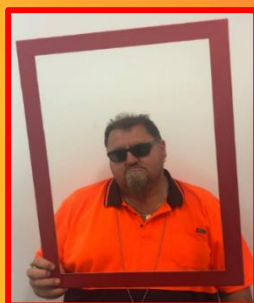
Big Fish GROUNDSMAN